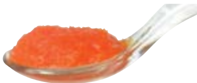
Well mashed carrot