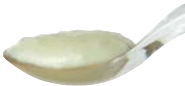
Baby rice mixed with milk