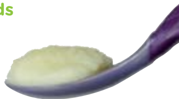
Well mashed potato